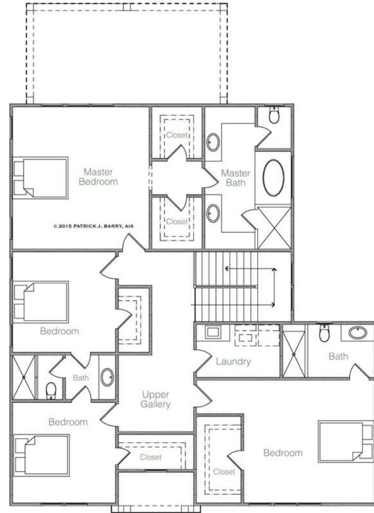
Upper Level Floor Plan